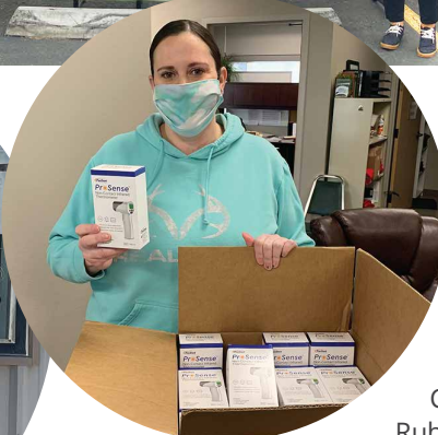
Boys and Girls Clubs of Elko, Family Resource Center of Northeastern Nevada, Friends in Service Helping, the Healthy Communities Coalition, Great Basin College Child and Family Center, and the Terrace at Ruby View Senior Center.

the thermometers would help keep the adult day care centers safe for those who depend on the facilities to take care of their loved ones.